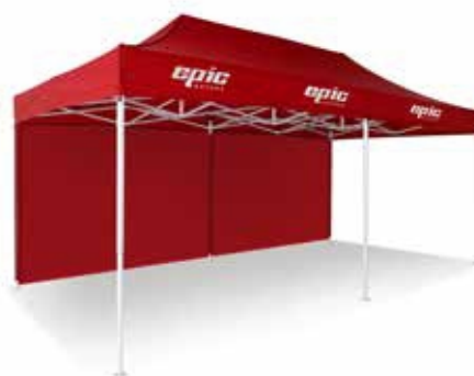
6 x 3 m

High quality tents – stable and easy to set up