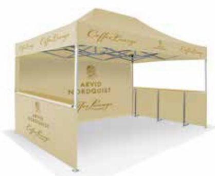
4,5 x 3 m