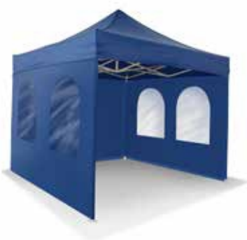
3 x 3 m